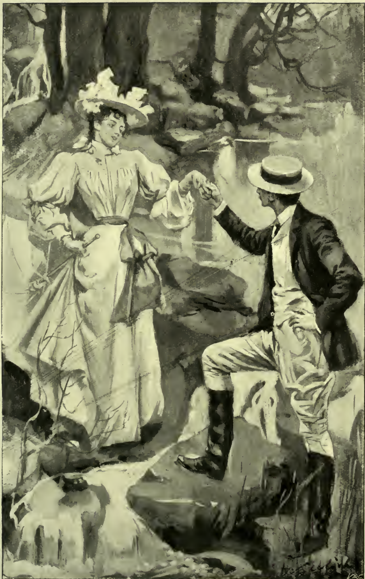
They emerged, holding each other's hand.